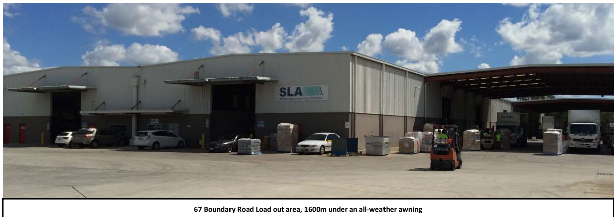
67 Boundary Road Load out area, 1600m under an all-weather awning