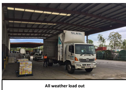
All weather load out