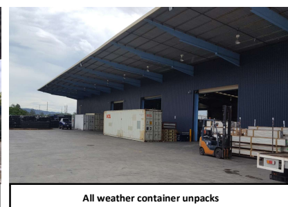
All weather container unpacks