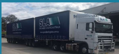
SLA – New B Double December 2017