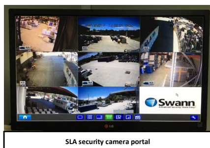
SLA security camera portal

SLA has a safety record that we are proud of and are committed to improving at every opportunity.