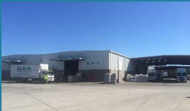
SHED 01 67 BOUNDARY ROAD, CAROLE PARK 4300