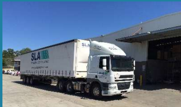
SLA Prime Mover outside Carole Park Depot