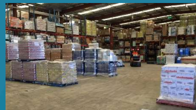
Carole Park – day freight holding area inside shed